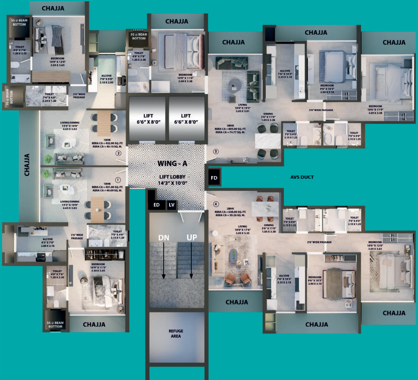
WING A - TYPICAL FLOOR PLAN